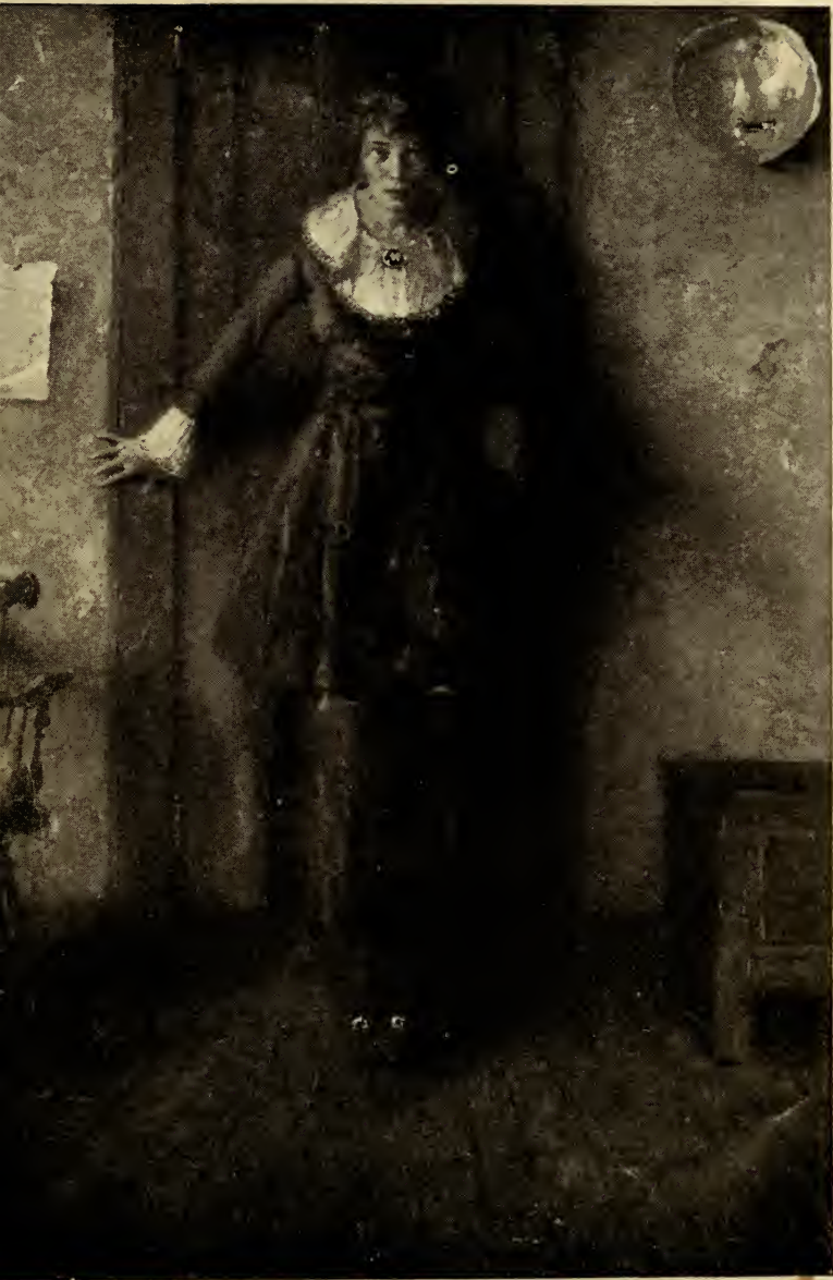
The mystery girl had entered and closed the door.